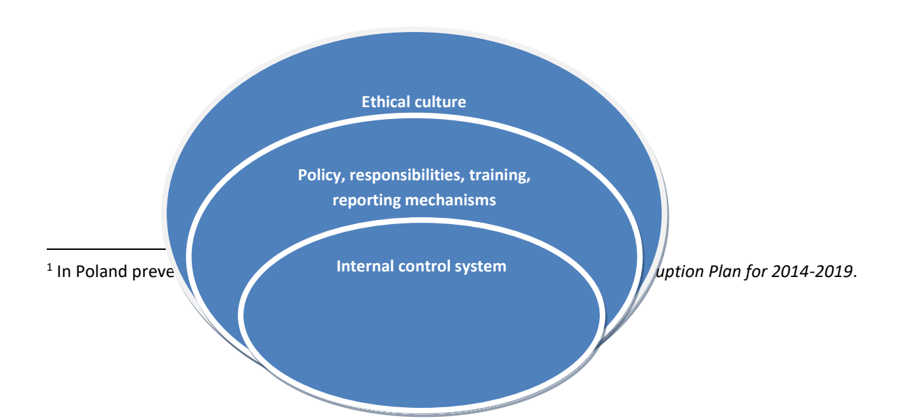
Fig. 2. Prevention structure.

EC Guidance defines four types of prevention actions that are the most effective in combating fraud: ethical culture, internal control system, fraud risks analysis, and policy, responsibilities, training, reporting mechanisms. Their significance and structure are presented in Fig. 2. The EC emphasises that comprehensive implementation of all these actions brings about optimum effects.