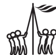
Cooperation capacity building